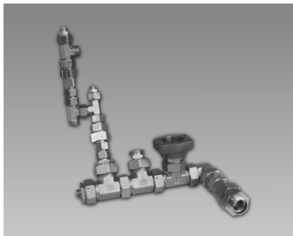
1. Situation customer

Highly qualified and experienced design engineers are continually developing new solutions to replace conventional and expensive products. Thereby mostly large screw connections are replaced by complete variants.